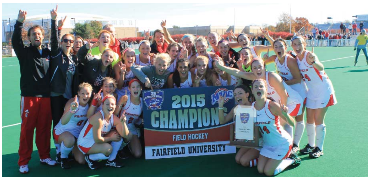
2015 Fairfield University Field Hockey Team