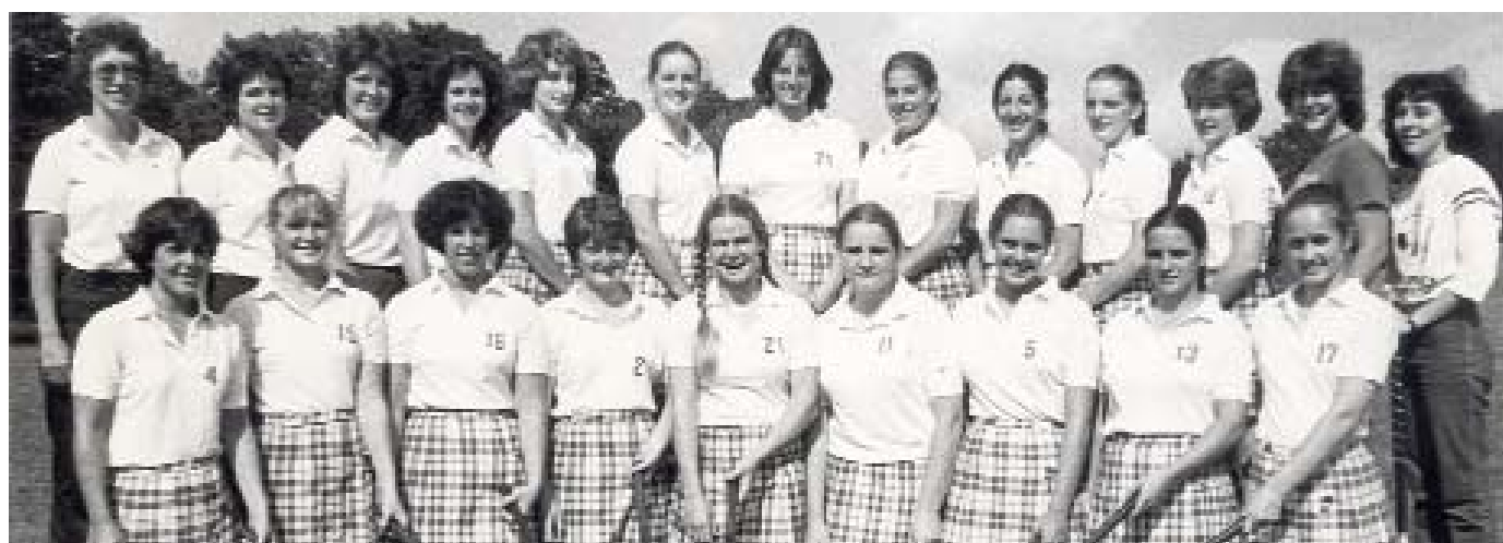
1980 Fairfield University Field Hockey Team